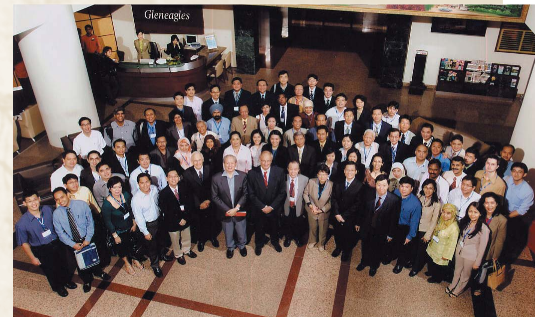
Participants of the International Macula Meeting 2005